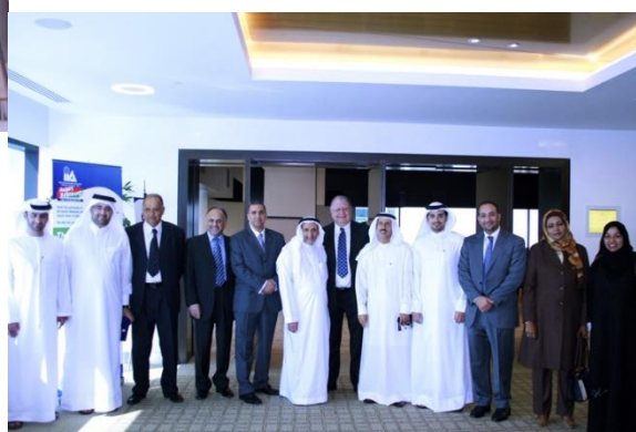
Abu Dhabi colleagues