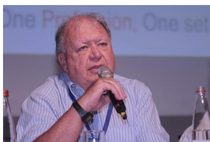
Speaking in Israel