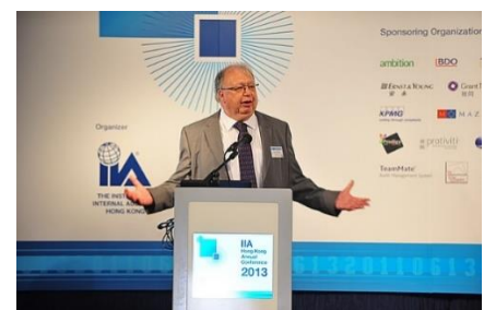
Speaking in Hong Kong