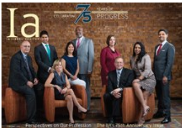
Special Edition: Celebrating The IIA's 75th Anniversary