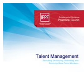
NEW! Practice Guide: Talent Management Recommended Guidance