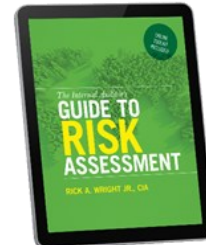
January Institute Book of the Month