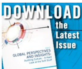
Global Perspectives and and Insights: Auditing Culture – A Hard Look at the Soft Stuff